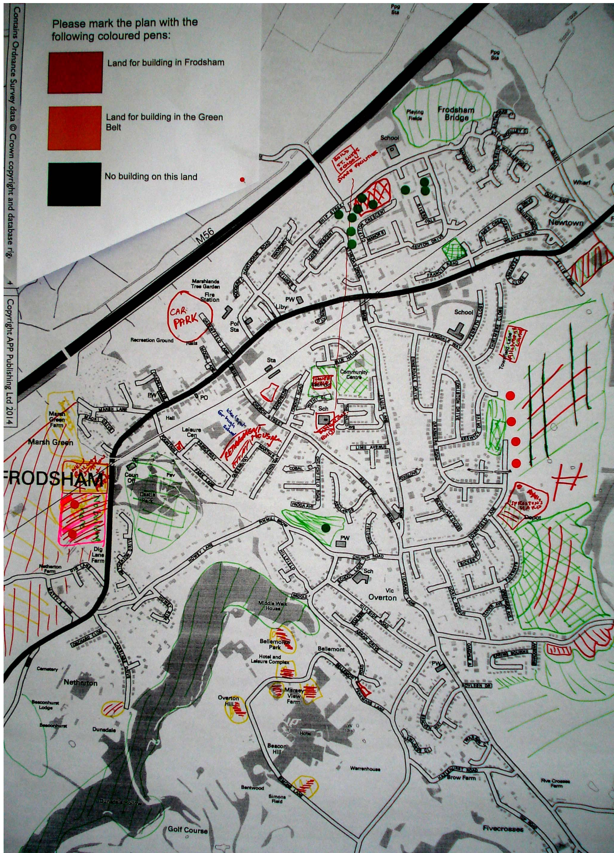
Figure 3 – Frodsham Area